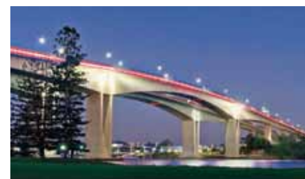
Above: The Sir Leo Hielscher Bridges turn red to support charity.

For more information or to make a donation, visit www.haemophilia.org.au .