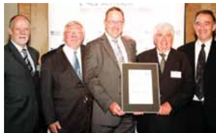
↑ ABOVE: THE QUEENSLAND MOTORWAYS TEAM ACCEPTS THE NATIONAL INFRASTRUCTURE PROJECT OF THE YEAR AWARD.

This award is the second for the project, having won an Engineers Australia State Engineering Excellence Award in 2007 for its procurement phase.